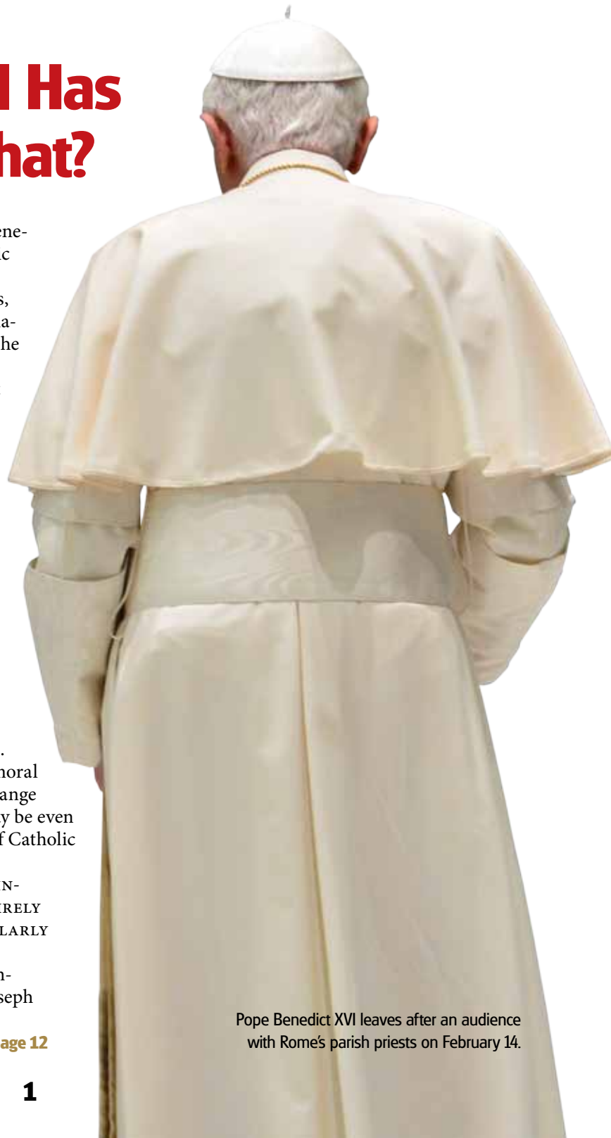
Pope Benedict XVI leaves after an audience with Rome's parish priests on February 14.