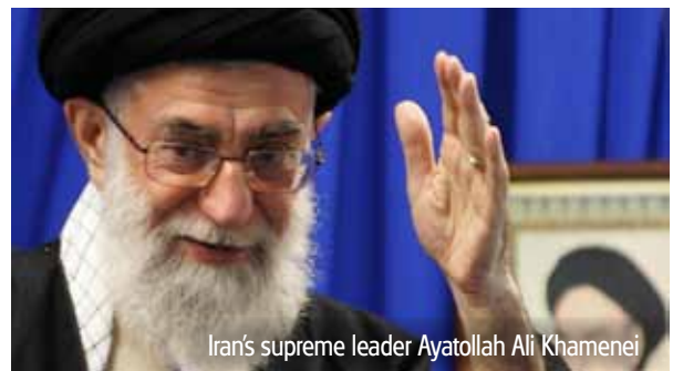
Iran's supreme leader Ayatollah Ali Khamenei

Direct talks with the United States over Iran's nuclear program will not resume, Iran's supreme leader announced on February 7. The speech came as yet another round of economic sanctions were implemented on Iranian oil. "Direct talks will not